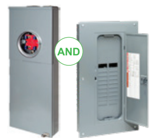
Meter main Outside