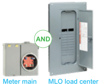
Meter main MLO load of Outside Inside